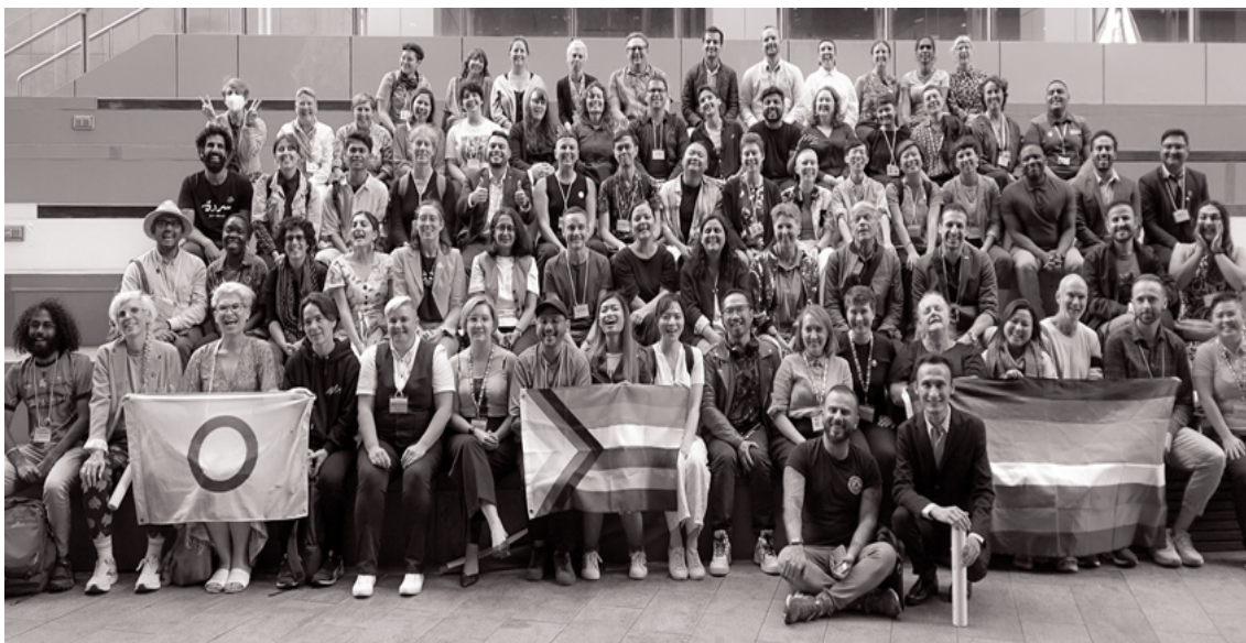
Forcibly Displaced People Network (FDPN)

Important in this area is RCT Inc.'s link with the Bridge to Safety program, launched by the Forcibly Displaced People Network (FDPN) *1 in partnership with Refugee Advice and Casework Service (RACS) *2 , designed to provide specialised, peer-led support to assist LGBTIQ+ people from the Asia and the Pacific regions who are facing persecution based on their sexual orientation, gender identity, expression, or sex characteristics. The program's goal is to help LGBTIQ+ refugees access priority processing for humanitarian visas and to overcome barriers to resettlement.