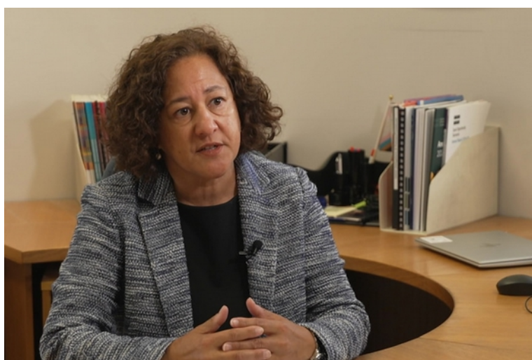
Pia Saturno, Tasmanian Anti-Discrimination Commissioner

While arranged cultural persecution and discrimination including arranged marriages and “honour-killings” are illegal in Australia, in local expatriate multicultural communities these cultural habits are not discouraged or prosecuted as they ought to be. Through the Multicultural Council of Tasmania (MCOT), RCT Inc. took a stand. Disappointingly, MCOT did not support this stand as it might have, and RCT Inc. representatives were treated very harshly by some members of the committee and security staff. This perhaps happened because of inherited attitudes concerning diversity, as well as cultural abhorrence of publicly discussing any kind of sexuality by immigrants from those countries.