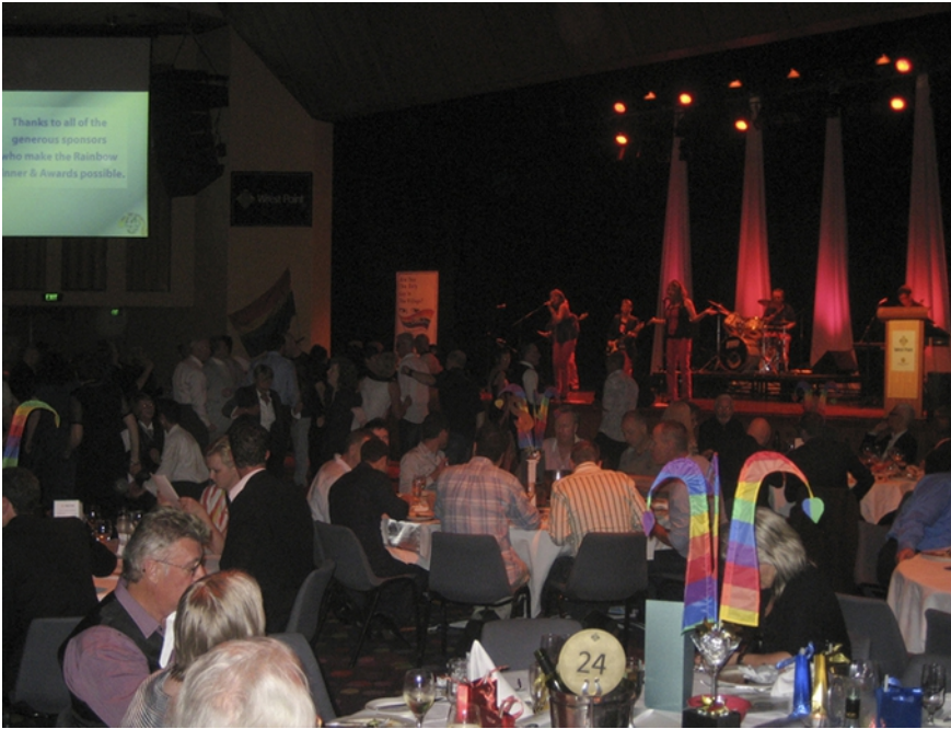
The League of Gentlefellows' Annual Rainbow Dinner

The RCT Inc. funding guidelines and governance have now established that our resources and objectives in protecting and providing a voice to the LGBTIQ+ communities locally, nationally, and internationally, are re-dedicated to this critical purpose and intent, requiring the work of dedicated members of the organisation and friends acting with the support of the resolute Committee of Management.