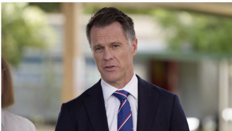
Mr Minns says the government is looking at bringing in 'massive new penalties'.